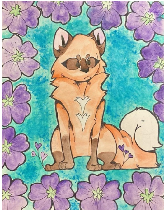
Aubrey Sosa - 8th Grade

We believe all students can and will create their own independent mixed media watercolor drawings as measured by using various watercolor and value techniques.